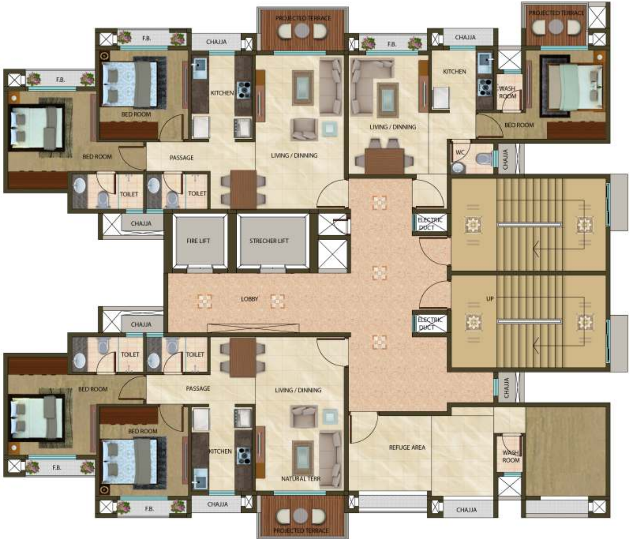
14TH FLOOR PLAN