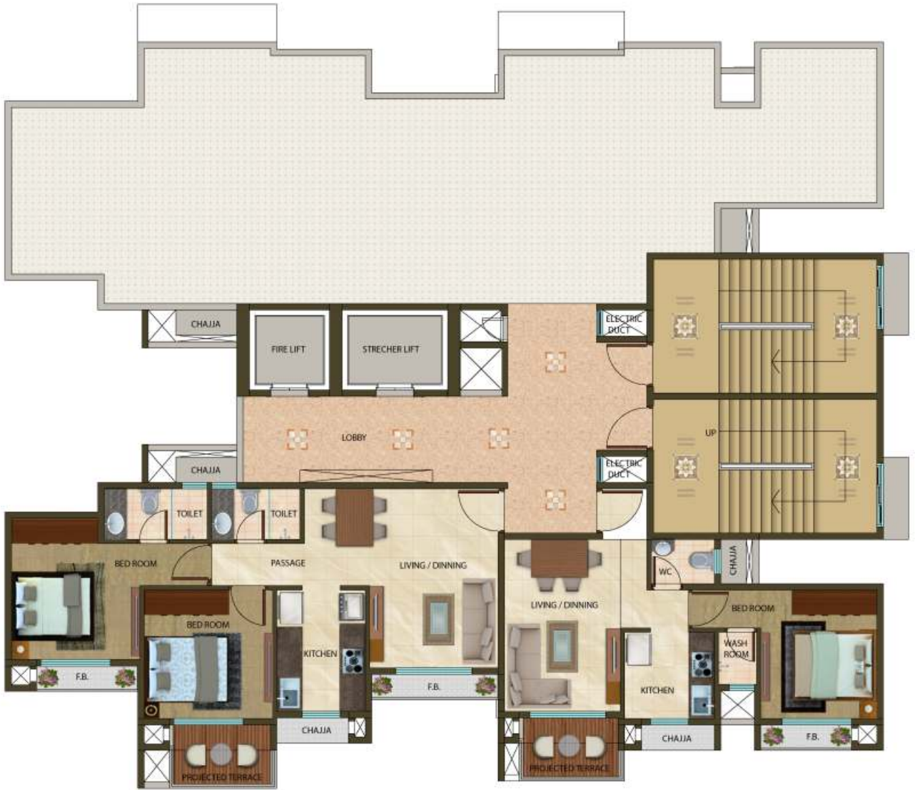
19TH FLOOR PLAN