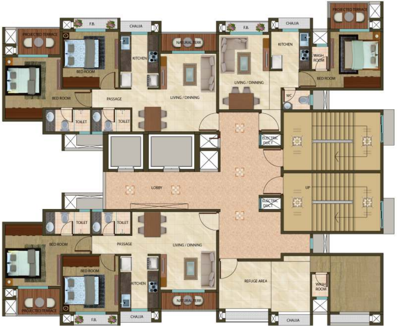
18TH FLOOR PLAN (REFUGE)