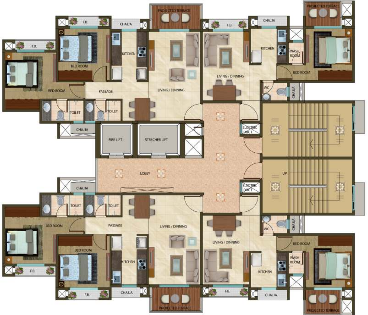
8TH FLOOR PLAN