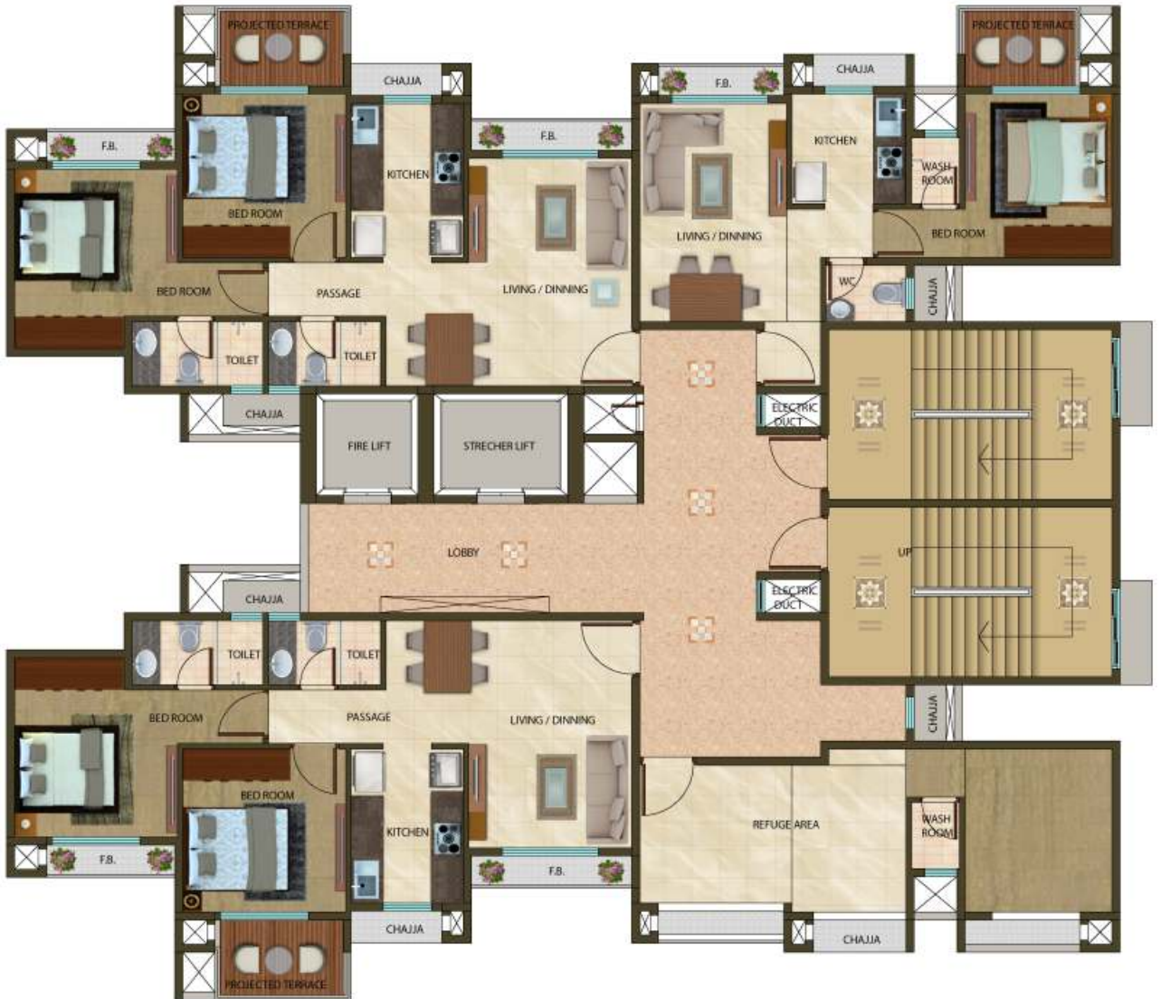
10TH FLOOR PLAN (REFUGE)