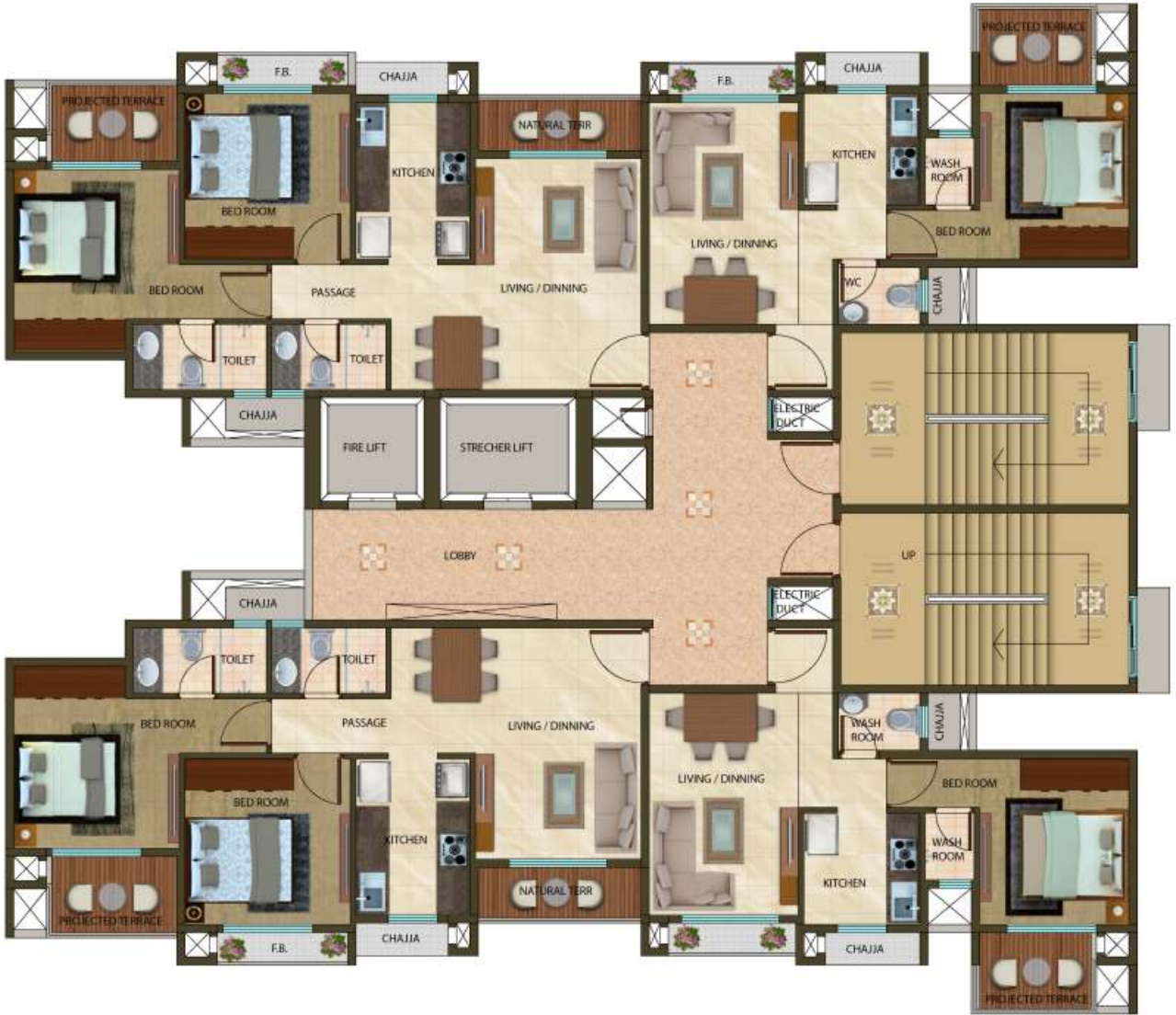
12TH FLOOR PLAN