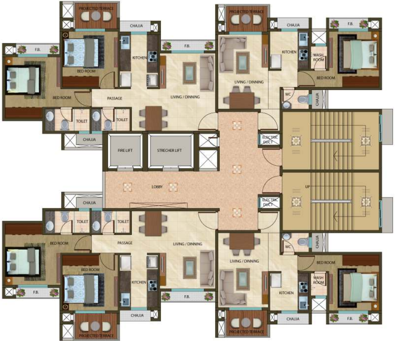
7TH FLOOR PLAN