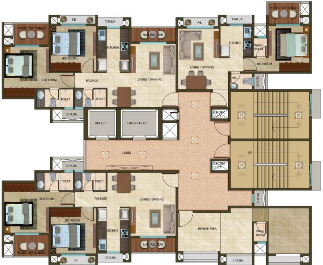
6TH FLOOR PLAN (REFUGE)